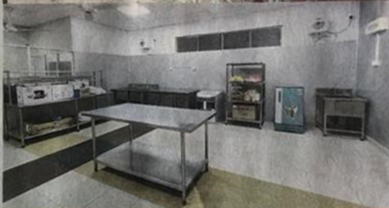
The Amunukumbura Vocational Training Centre in Gampaha is dedicated to youth with disabilities and managed by the Department of Social Services.

Today, ChildFund Sri Lanka in partnership with Gamma Pizzakraft Lanka (Pvt).Ltd., currently single franchisee for Pizza Hut and Taco Bell in Sri Lanka and with guidance from the Department of Social Services inaugurated a unique project at the Centre, providing these youth with disabilities the necessary resources, connecting them with market relevant training, skills and opportunities enabling them to dream of a brighter future.