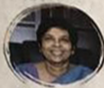
Hon. Dr. Sudarshini Fernandopulle, M.P. - State Minister of Primary Health Care, Epidemics and COVID Disease Control

As the government of Sri Lanka we respect the rights of differently abled and disabled people and committed to their economic, social security rights and need of equal opportunities to improve their quality of life. The Department of Social Services which is under the State Ministry of Primary Health Care, Epidemics and COVID Disease Control has several Vocational Training Centres around the country catering to the rehabilitation and training of many youth with disabilities. I would like to extend my congratulations on the opening of the pizza and food technology training unit with state-of-the-art technology facilities affiliated to the food technology division at the Amunukumbura VTC with ChildFund Sri Lanka in collaboration with Gamma Pizzakraft Lanka (Pvt) Ltd., under the guidance of the Department of Social Services.